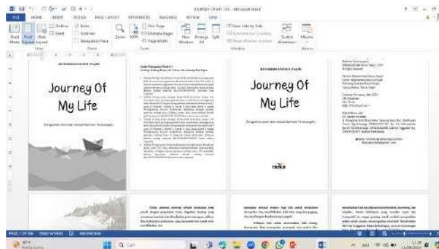
Figure 3. Razka Pustaka Layout Process

Razka Pustaka has implemented digital technology in various stages of the publishing process, such as manuscript submission, editing, design, and printing. The use of collaborative software, digital layout tools, and print-on-demand printing machines has increased efficiency and flexibility in producing Islamic books (Putriana, 2023).