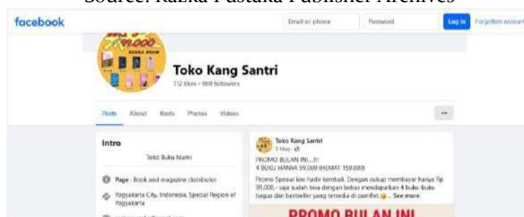
Figure 9. Kang Santri's shop