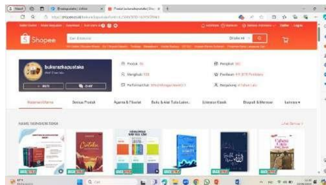
Figure 2. Razka Pustaka's Shopee selling account