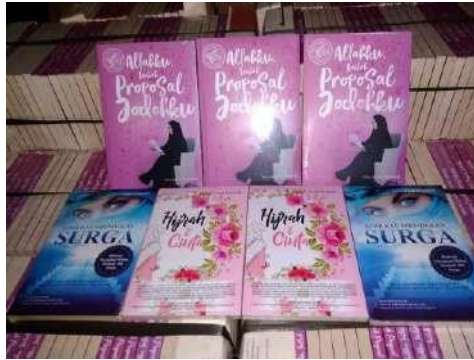
Figure 7. Razka Pustaka Book Inventory

To support comprehensive digital transformation, Razka Pustaka has also integrated various internal systems, such as inventory management, accounting, and human resources. This integration allows Razka Pustaka to obtain integrated data and support more effective decision making (Al Azis, 2021).