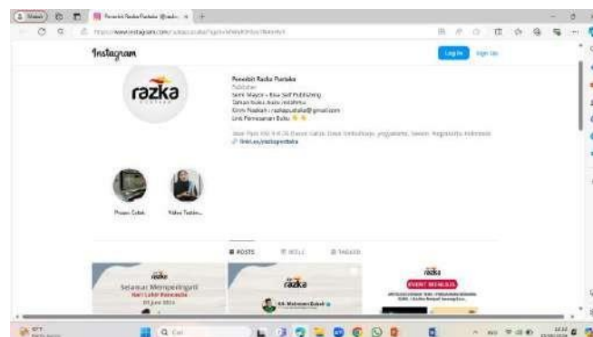
Figure 8. Razka Pustaka Instagram account

Razka Pustaka has utilised various digital platforms to increase marketing activities and engagement with readers. This includes the use of social media, digital campaigns, as well as the launch of YouTube channels and podcasts to reach a wider audience. Through relevant and engaging content, Razka Pustaka has managed to build a loyal community of readers while attracting the younger generation. This strategy not only expands its reach, but also reinforces its image as a publisher that is adaptive to technological developments. By utilising the power of digital, Razka Pustaka is able to provide a more interactive and innovative reading experience.