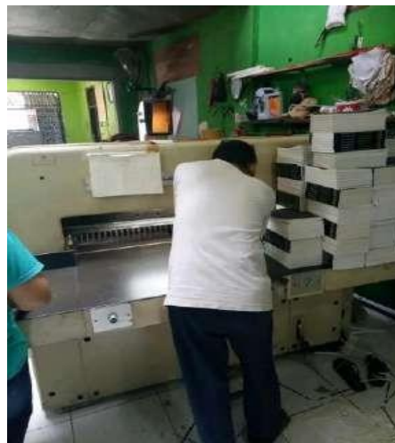
Figure 5. Razka Pustaka Book Printing Process