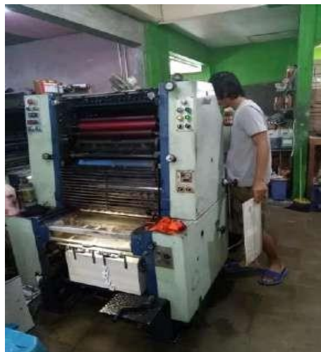
Figure 6. Razka Pustaka printing machine