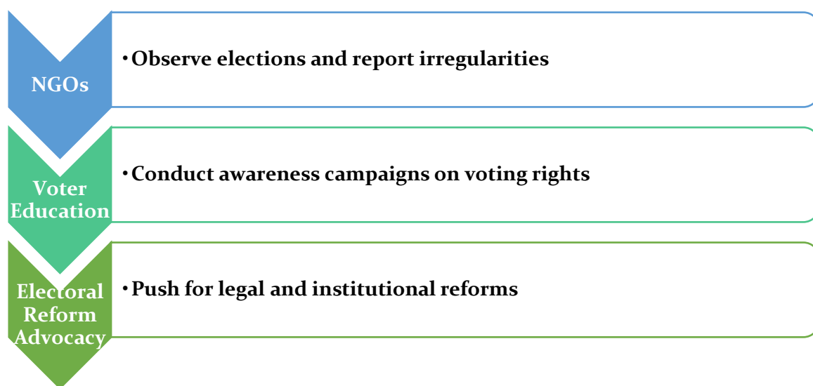
Figure 2. Role of Civil Society in Democratic Processes Source: Author's own compilation based on relevant literature

promotes social justice, and advocates for public interests. Civil society is essential for strengthening democracy and enhancing community resilience (UNESCO; 224th session of the Executive Board: 8-23 April, 2026). It plays a core role in electoral of a democratic country which influences the accountability of the governments and social justice that can help to ensure the fairness of election in every country. They usually pronounce their in-depth knowledge regarding a particular issue which motivates the opinion of others (Mohyeddin, 2024). During election they digs out various loopholes from the manifesto of the political parties which elaborates and dissects the internal political commitments that motivate the opinion of the general voters. During electoral campaign it impacts much to the opinion of the common voters for electing a particular candidate. Figure 1 shows the most important parts of the media's role in making sure elections are fair. These include media bias, the influence of traditional and digital platforms, media independence, and the media's role as a watchdog or propaganda tool. It shows how these things affect how much voters know, how open elections are, and how trustworthy elections are overall.